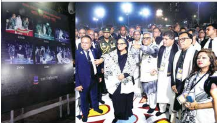
Prime Minister Sheikh Hasina looking at an exhibition comprising 21 rare photos of her 21 times visit at the Central Shaheed Minar for paying homage to Language Martyrs as head of the government at 12:01 AM on February 21, 2024. This event was organised for the first time by Dhaka University.