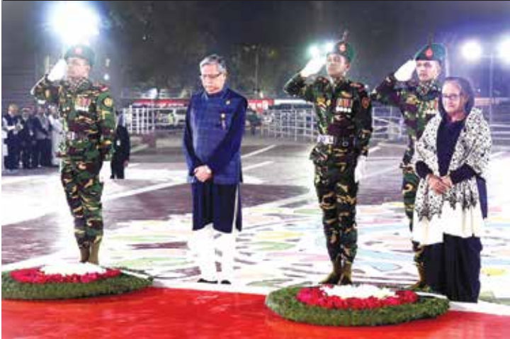
President Mohammed Shahabuddin and Prime Minister Sheikh Hasina paying homage to Language Martyrs at 12:01 AM on February 21, 2024 at the Central Shaheed Minar.